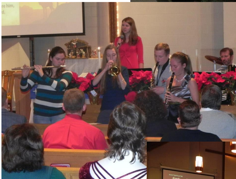
Christmas Eve Candlelight Service