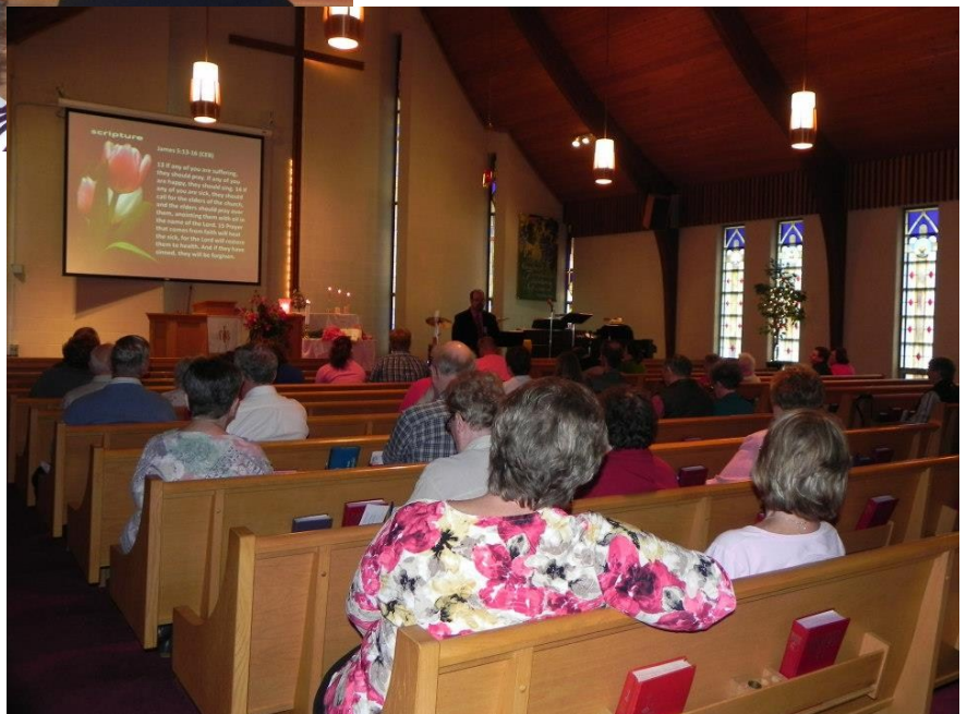
Pray in Pink Sunday