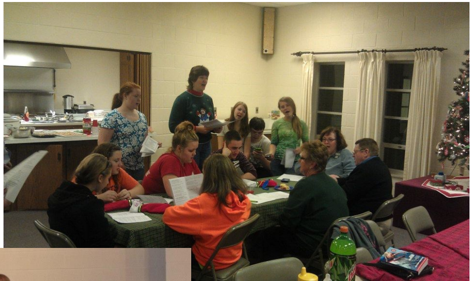
Christmas Phone Caroling