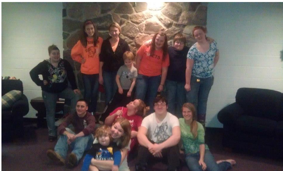
Youth Christmas Party